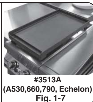
#3513A (A530,660,790, Echelon) Fig. 1-7

CAUTION: This accessory will remain hot some time after use. Allow time for it to cool before handling and/or cleaning.