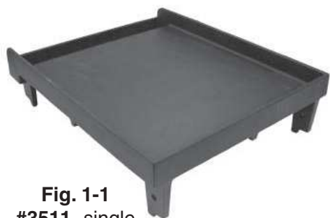
Fig. 1-1 #3511- single sideburner griddle