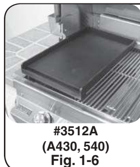
#3512A (A430, 540) Fig. 1-6