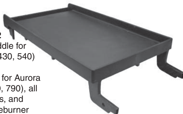
Fig. 1-2 #3512A - Griddle for Aurora Grills (A430, 540) -or- #3513A - Griddle for Aurora Grills (A530, 660, 790), all Echelon Grills, and the double sideburner (see Fig. 1-7 below)

This unique stick-resistant griddle by Fire Magic is an excellent cooking accessory for the well-stocked outdoor chef. Grilling meats, fish, vegetables, or even preparing breakfast is made easy with this top quality griddle. The griddle is crafted of heavy gauge cast iron with a special stick-resistant coating and features a smooth, flat surface. The stick resistant, easy to clean surface offers the most in carefree and healthy cooking, does not peel or blister—and is safe for use with metal utensils! Each griddle has a deep collection trough in the front for fats and cooking juices created during cooking.