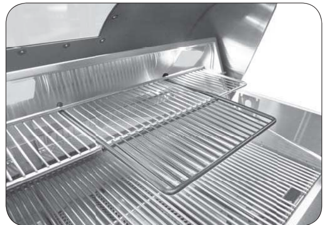
Fig. 1-2 Warming rack extender in place